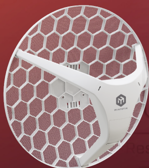
LHG 5 ax

A compact, long-range CPE with a 24.5 dBi antenna. Perfect for links up to 20 km in most scenarios.