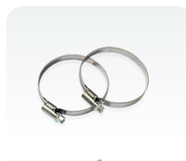
2x hose clamps