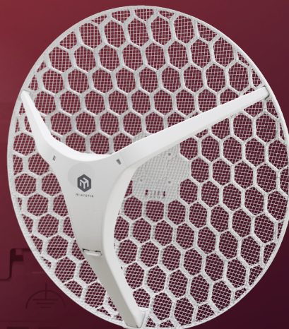
LHG 5 ax XL

A compact, long-range CPE with a 24.5 dBi antenna. Perfect for links up to 20 km in most scenarios.