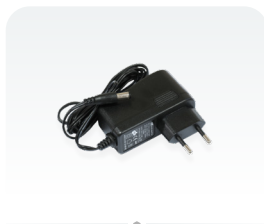
24 V 0.38 A power adapter