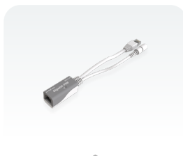
Gigabit PoE injector