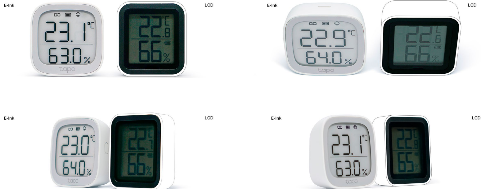
Comparison between an E-ink display and a backlit display.

Features a 2.7" E-ink display that reads like real paper. No screen glare and daylight readable with a 180 degree viewing angle.